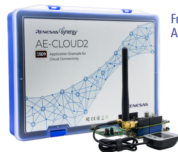
Free Renesas AE-CLOUD2 Kit